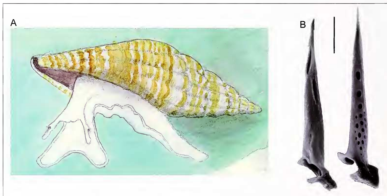
Fig. 2. A. Living mollusc, from Brucoli (eastern Sicily) [drawing by GS]. B. Radular tooth, scale bar = 25 µm [SEM A. Warén]; specimen from Ceuta (Spain, northern African coast).

Shell spindle-shaped, 11 mm high, with 7 teleoconch whorls, decorated with axial costae – of which 8 on last whorl – of rounded section, with slight bend at suture insertion. Very thin spiral striae – in a few specimens alternating with a few in higher relief – in intervals between axial costae. Aperture elongate, narrow, hardly higher than half last whorl. Anterior canal relatively short, straight, sculptured with striae that are sparser, more oblique and more prominent than those between axial costae. C-shaped posterior sinus thickened by callos extending over inside outer lip. Thick, wide varix outside rim of lip. Protoconch paucispiral (< 1.5 whorls), smooth apart from a few markedly arched axial folds, crossed by a series of very slender spiral striae, microsculpture marking passage to teleoconch. Background colour ranging from whitish to ivory, with spiral yellowish stripes that become denser on lower half of last